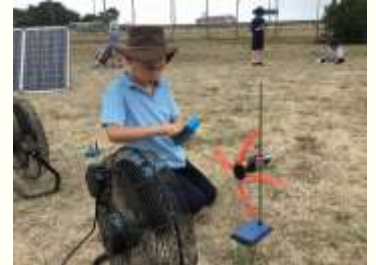
Below: Learning about renewable energy