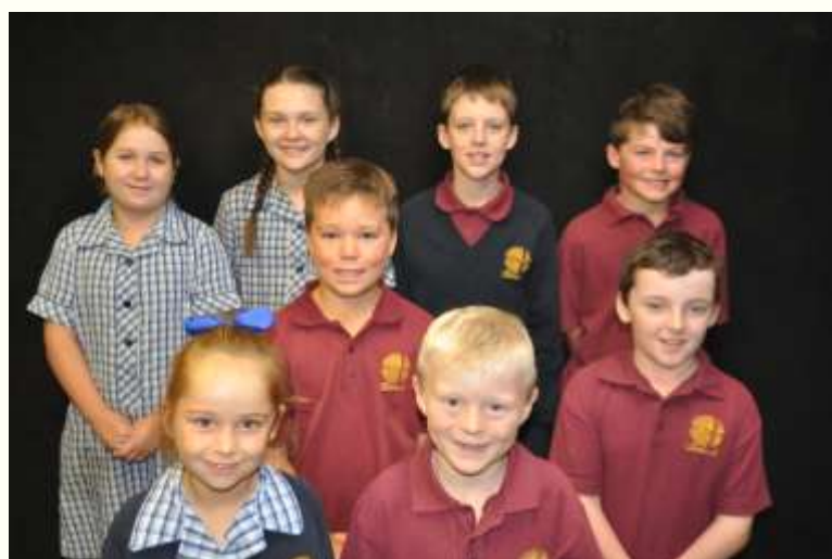
St Augustine's SRC members Yr 1 – Yr 6